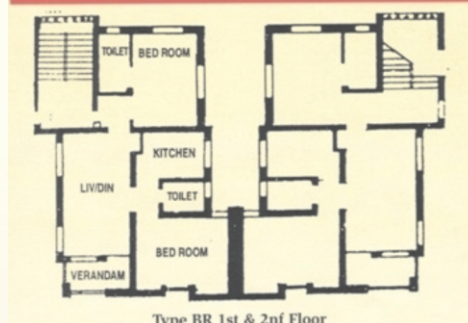
Type BR 1st & 2nd Floor